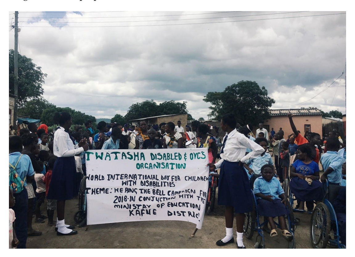
Photo 2: March at Ring the Bell event (Disability Awareness Raising event). 2018. Kafue

Since the YV members were currently not as active as they were in the year 2015-2016, because of lack of funding for 2018 and lack of further programming, this method was limited to the conversations and visiting the three public events (see Photo 2). The group didn't come together formally anymore for meetings or other activities. They did however, come together for the purpose of the research.