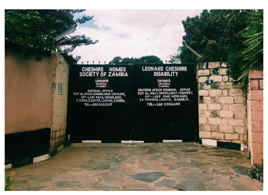
Gate of Cheshire Homes Society of Zambia National Office, Strategic Partner Organisation of Liliane Foundation. 2018. Lusaka