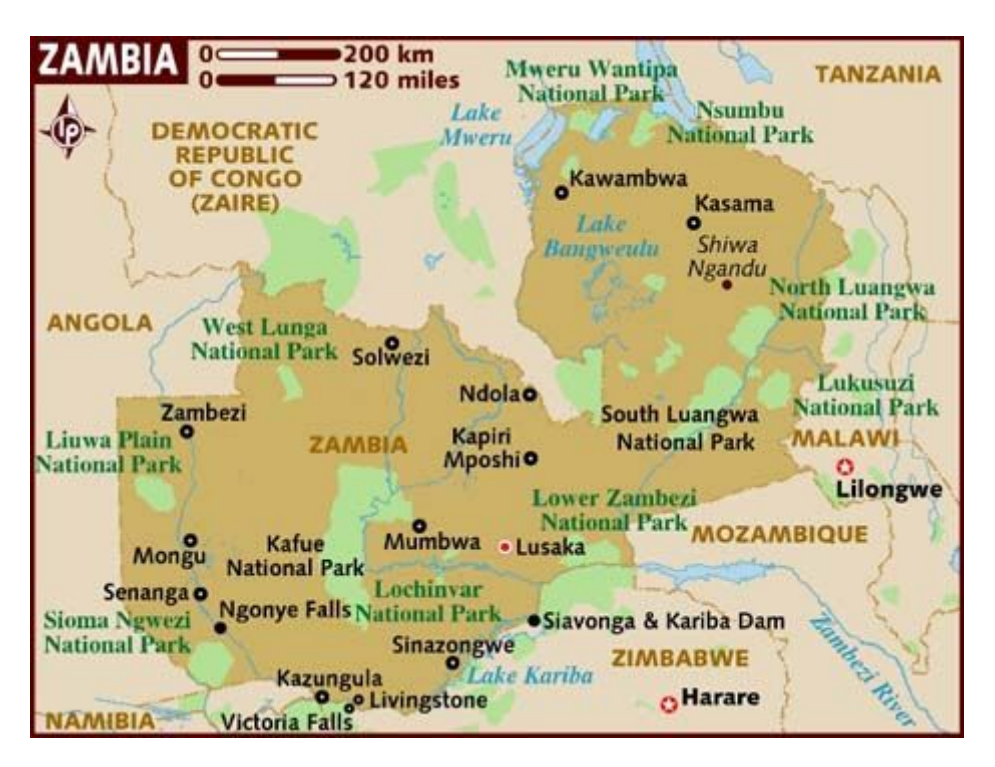
Figure 2: Map of Zambia, accessed on June 14, http://ontheworldmap.com/zambia/

First of all, Zambia (see Figure 2) is a very widespread country, which also holds true for her cities. The city of Lusaka is 412 square kilometres big<sup>2</sup>. The surface in combination with poor infrastructure dating from the early 60's, before independence, add up to constant traffic jams. Because I did not have my own car I relied on taxis and colleagues, which created a certain dependance and limitation to the number of appointments I was able to make on any one day. In addition to this, using public transport in Zambia is time-consuming in itself. Public transport consists of minibuses which are mainly focused on being occupied to the full amount rather than driving the fastest and most efficient route. It could take up to a three hour drive to Kafue, which is only 40 kilometres. This limited my flexibility in terms of going to appointments in different places in the day, which means I would spent most of the day traveling to the different locations.