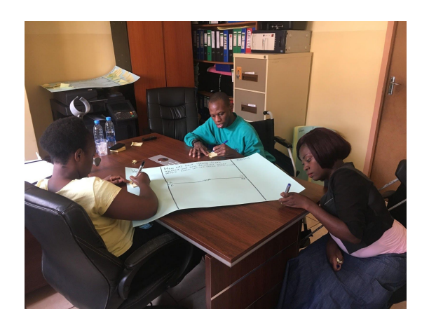
Photo 3 and 4: Participation of Young Voices members in Focus Group. 2018. Lusaka