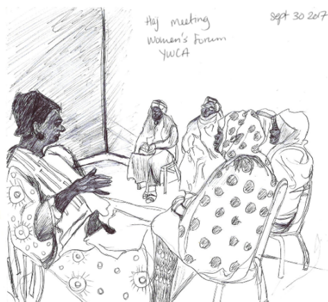
Drawings/Sketches 1: Celebrating the return of five Muslim women from the hajj.

In fact, these songs are often used in many other situations. I observed their use in two contexts: first during the national "Consultative Women's Meeting for the 2018 Elections" in Kamakwie, Karena District (on October 7, 2017) (see Drawings 3-5 and Photograph 9 55 ) where women discussed their plans for the elections; and second during the "Women's Loose Lapas" rally in which women were rallying for a minimum of 30 percent quota in electoral positions in the lead up to the 2018 elections (on December 21, 2017) (see Photographs 10-11). Altogether, these various activities during the WF's meetings help to engender its culture and CI, especially as they give members many opportunities to be seen and to be heard.