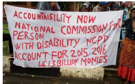
Photograph 6: NDC banner asking for accountability of the NCPD's 2015-2016 funds.