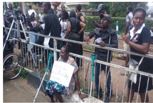
Photograph 4: SLUDI protestors waiting for the President's decision about the NCPD's subsidies.