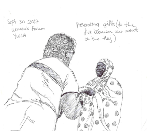
Drawings/Sketches 2: Presenting a gift to one of the Muslim women who went on the hajj.