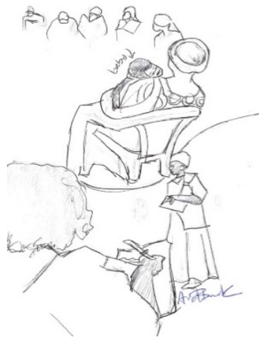
Drawings/Sketches 5: Random moments from the meeting.