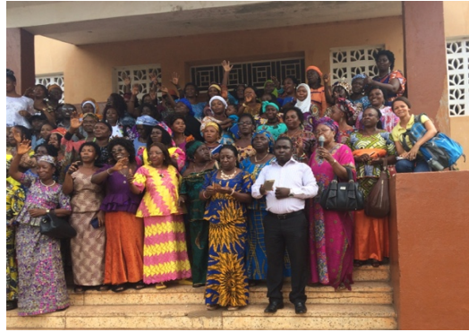
Photograph 10: Group photo.