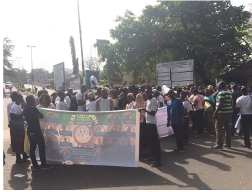
Photograph 11: Women's "Loose Lapas" rally supporters gathered near the infamous Cotton Tree.