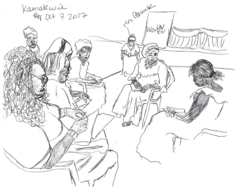
Drawings/Sketches 3: Group discussions.