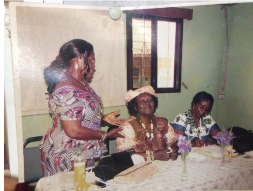
Photograph 9: One of the early Women's Forum monthly meetings at the YWCA.

“Women everywhere for equality, development, and peace”; today it has changed to “solidarity for empowerment equality and development” (archival data). Once these pieces were put together, the WF then registered at the Ministry of Social Welfare 43 in 1995 as a non-government organization (NGO).