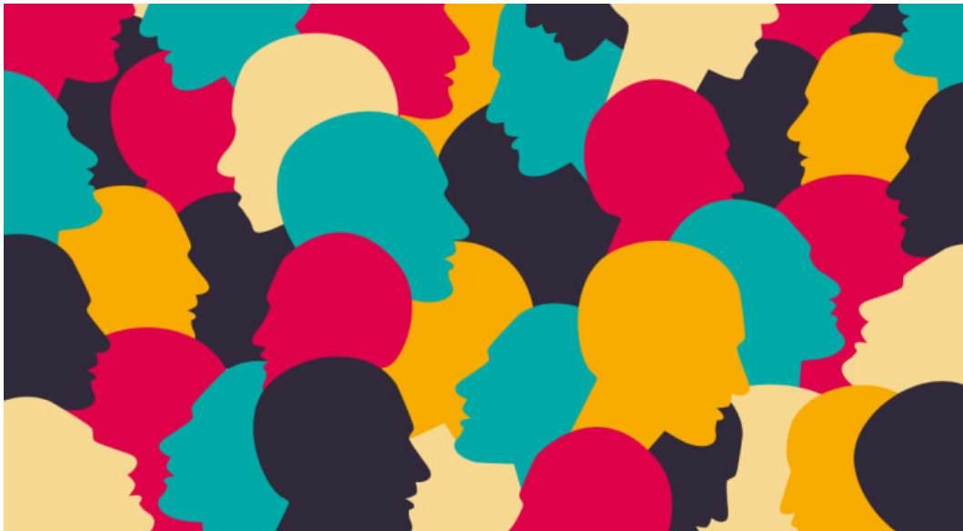
Photograph 1

A Comparative Case Study of the Women and Disability Movements' Collective Identity Formation and Maintenance in Sierra Leone