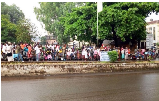
Photograph 7: 762 National Disability Coalition (NDC) protestors.

(1) the NCPD and SLUDI were said to be ‘misrepresenting’ PWDs because their lives remain unchanged; and (2) they wanted accountability and transparency from the NCPD for unaccounted monies and monies it was receiving to help improve PWD lives but were still unaccounted for. One of its leaders explained, “The current Union and Commission has been misrepresenting the voices of the disabled... a lot of PWDs are suffering. And the money, which the Commission is receiving is for PWDs. If they [the Commission] cannot account for the sums they received than we will stand with the Minister. This is our stance” (interview 30/10/2017). One of its supporters and an ex-SLUDI member said, “We formed the NCPD. From 2011 up to date, we no see no benefit, no effort for people with disability... money wae kam na de Commission, we no dae see de money, we dae sofa (‘money that has come to the Commission, that we have not seen yet. We are suffering.’). NCPD is not transparent at all” (interview 11/15/2017).