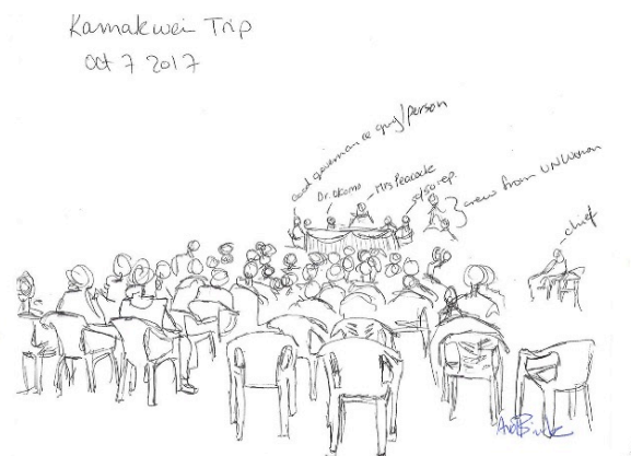
Drawings/Sketches 4: Seating arrangements of the meeting.