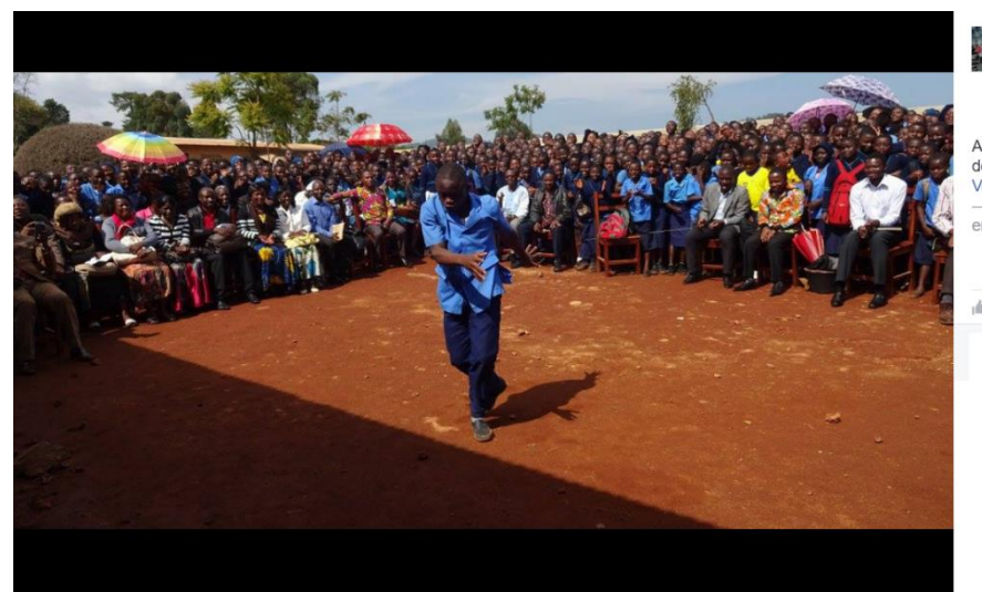
Photo 1 shows a more implicit example; where SEEPD communicated a message on their Facebook page which showed that children with a hearing impairment can also dance, and even have "talent of dancing".

"Well, simply to be persuasive, to give them examples of people with those impairments who have succeeded in school, succeeded in life, people who are working and who are achieving and contributing their quarter to the development of humanity" (Interview 2)