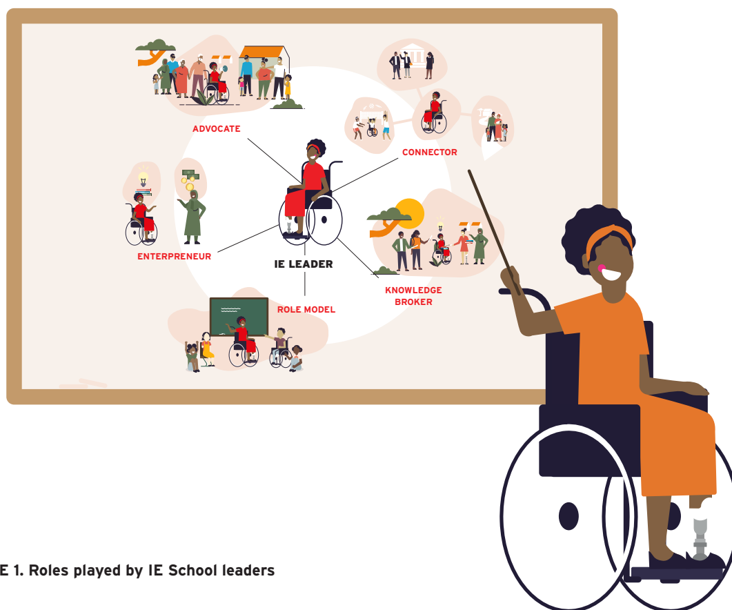
FIGURE 1. Roles played by IE School leaders

leaders, and which can be seen as the pillar of the others, is that of a role model (more about this below). In schools with more than one IE leader present, leaders are often complementary in their roles and strengthen each other. The high intrinsic motivation and knowledge and expertise of IE form the overall backbone of the roles identified.